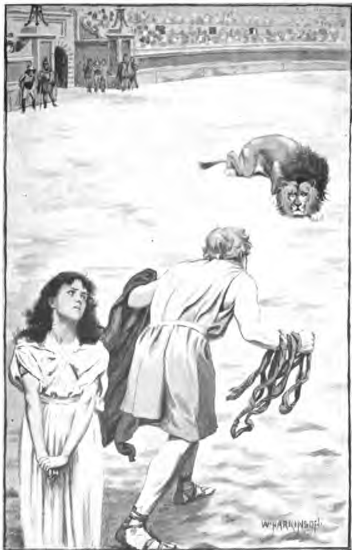
BERIC FACES THE LION IN THE ARENA